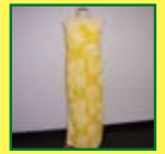
Vintage Lilly Pulitzer®