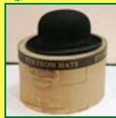
1920s Stetson Men's Hat